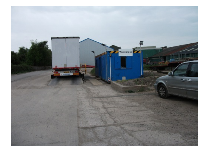
Report to weighbridge