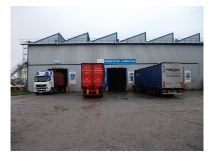
Driver will be directed to the loading bay