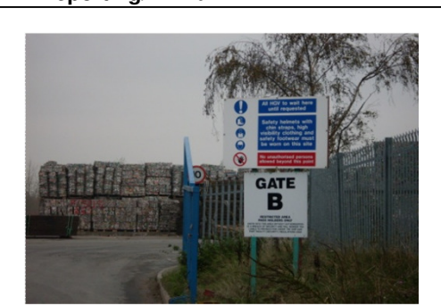
ON ARRIVAL STOP AT SECURITY GATE B