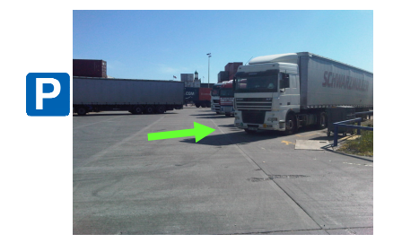
Park vehicle outside warehouse