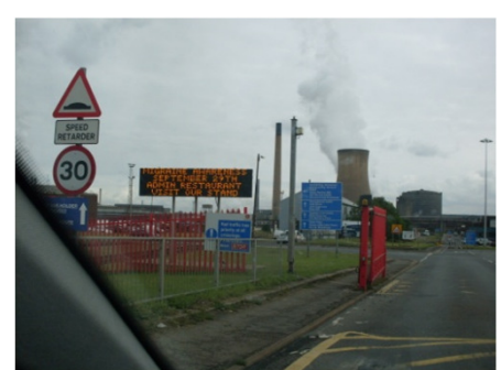
AFTER INDUCTION GATE D