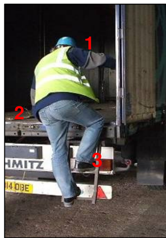
the sense of logistics